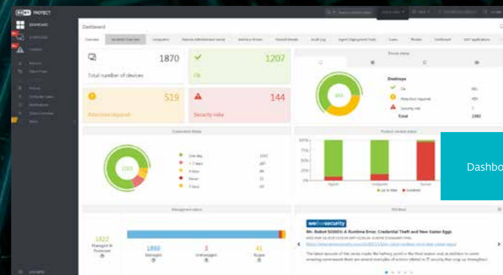
Dashboard of ESET PROTECT

ESET PROTECT fully supports SIEM tools and can output all log information in the widely accepted JSON or LEEF format, allowing for integration with Security Operations Centers (SOC).